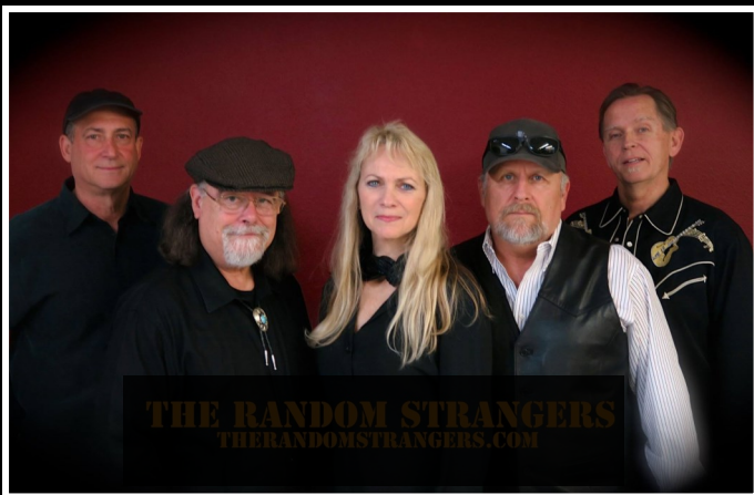
Saturday May 23 the random strangers

guaranteed reservations required and taken one month before event...call 209-795-1000 x 1