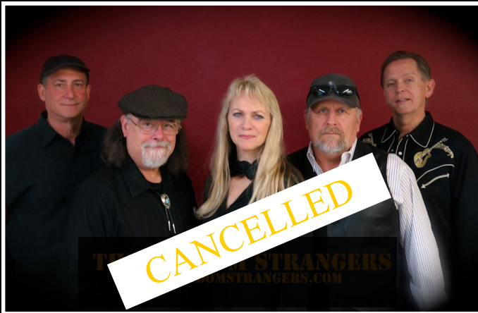
Saturday May 23 the random strangers

guaranteed reservations required and taken one month before event...call 209-795-1000 x 1