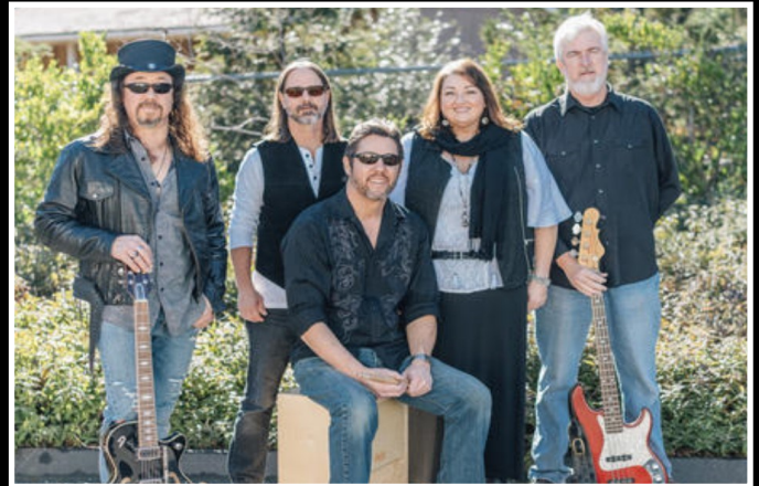
Saturday August 1 stomp box