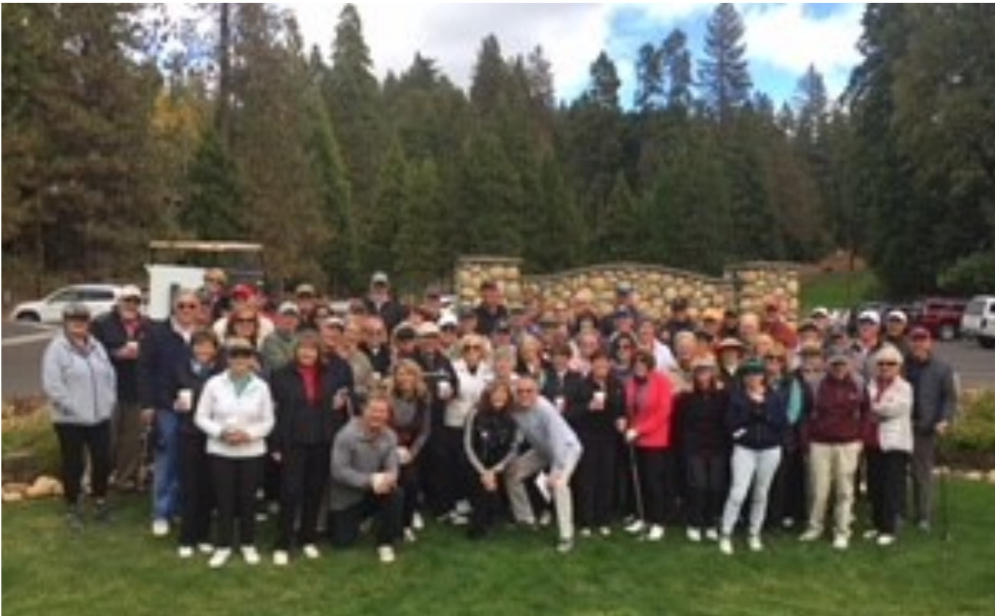
The last Couples Twilight meant bringing out the long slacks, long sleeves and jackets!