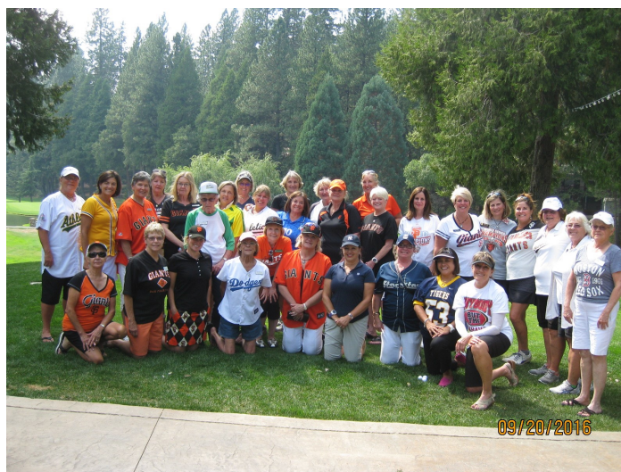
WNHGA Open Day - Ball game theme, with favorite baseball team shirts