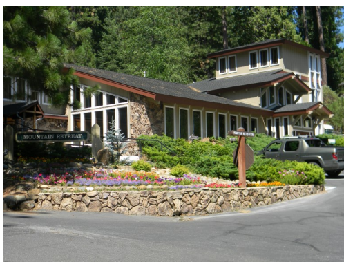
The Mountain Retreat, across the street from SWCC