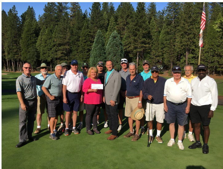
Men's Club presenting proceeds from the Charity Classic event to the Friends of Calaveras Sheriff's Office - September 2017

In closing, it was an honor to serve as your president this past year. Thank you all for your support and in making it an enjoyable experience.