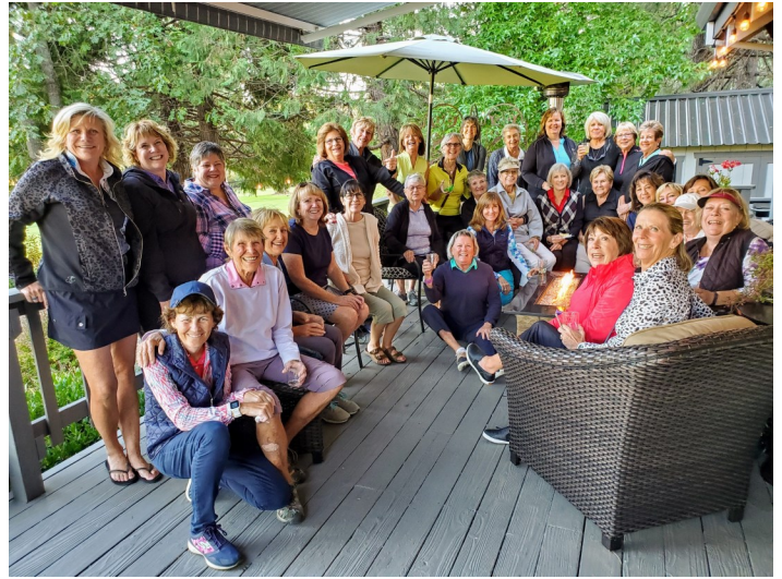
Ladies Wine and Nine...having a fun time!

Our staff and members say "hello" to you!