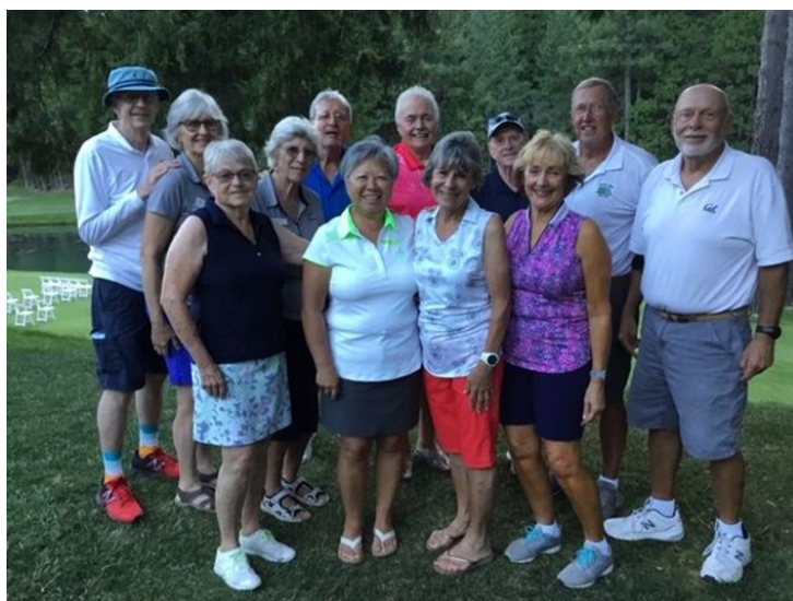
The Sequoians' Swing Into Fall Group of Winners!