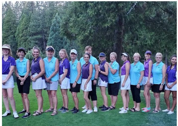
SWWGC hosted the Bret Harte High School Golfers in August 2019

Before or after a round of golf, you can take a walk in the North Grove of Calaveras Big Trees State Park. In October the dogwood trees are especially lovely!