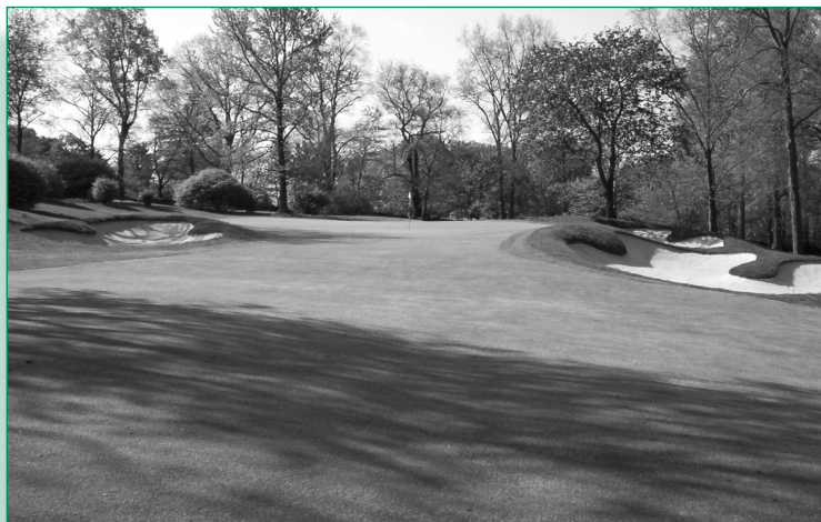
Cover: Brae Burn Country Club.