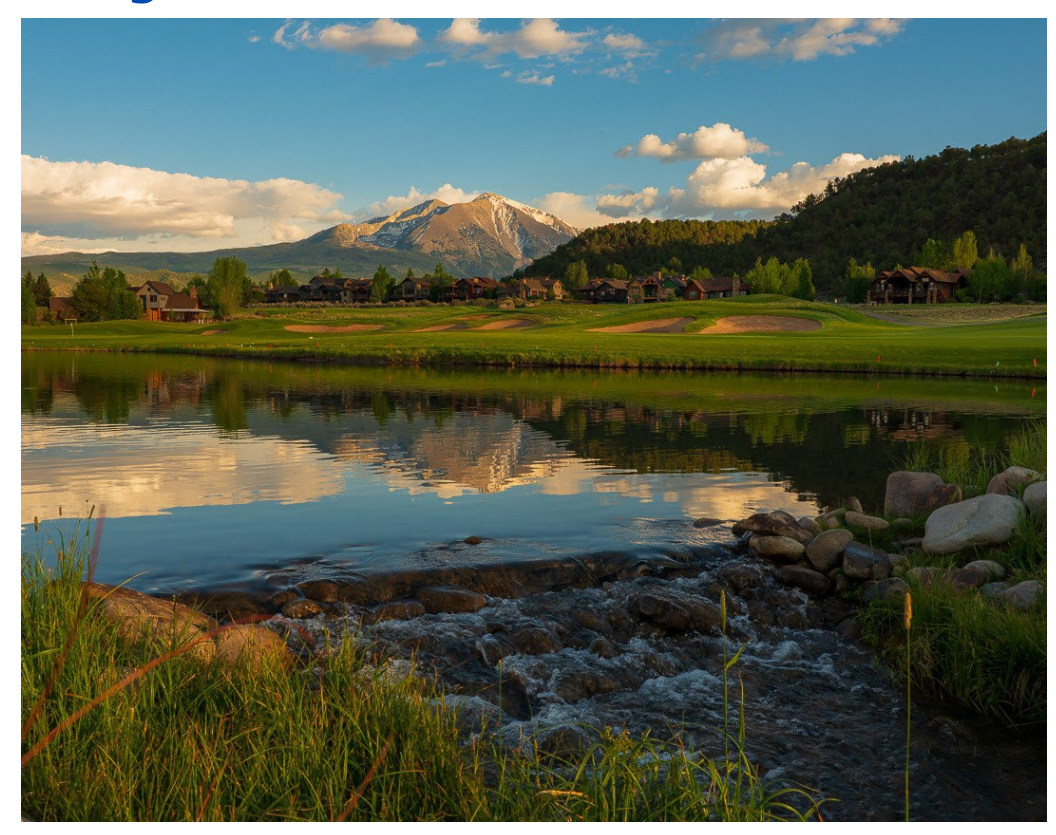
Top 10 Public Golf Courses Colorado 2022 Golf Week Magazine

Best Public Golf Course 2019 Golf Advisor