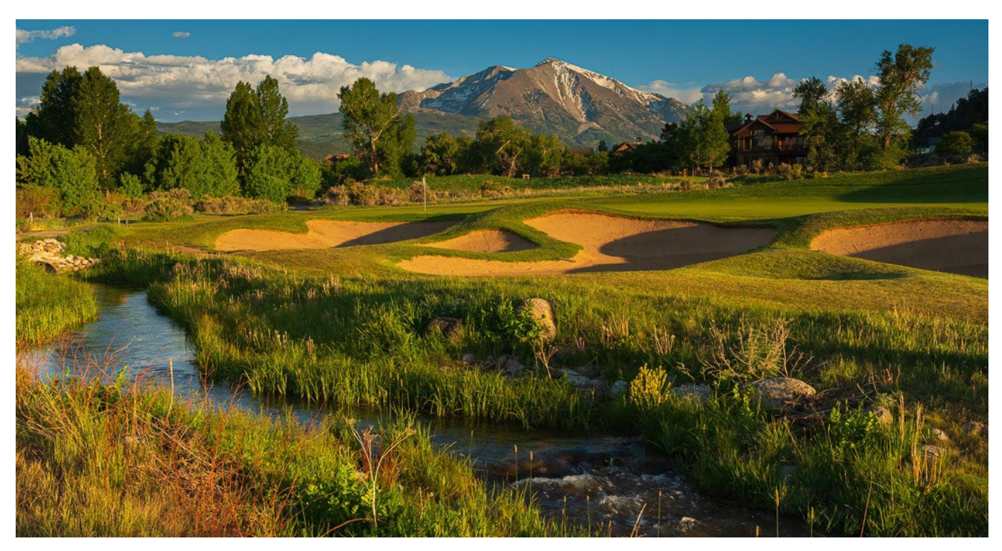
#2 Best Public Golf Course Colorado - NBC Golfpass