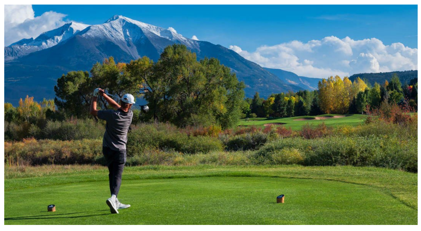
Best Golf Courses in Colorado 2022 -Golfers' Choice Golf Pass