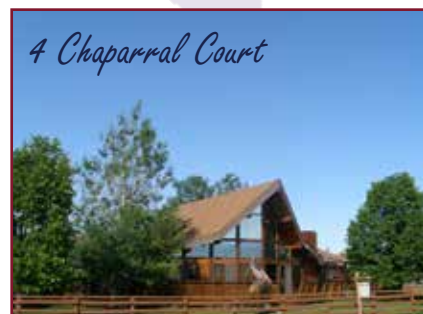
4 Chaparral Court