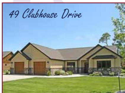
49 Clubhouse Drive