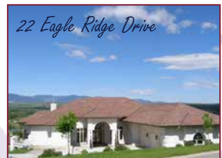
22 Eagle Ridge Drive