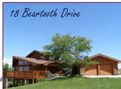
18 Beartooth Drive