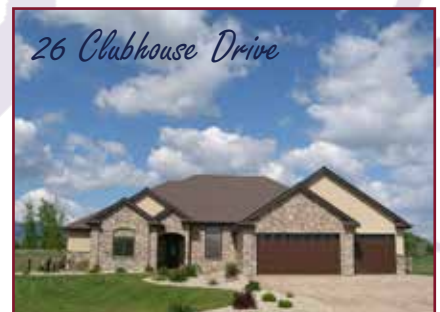
26 Clubhouse Drive