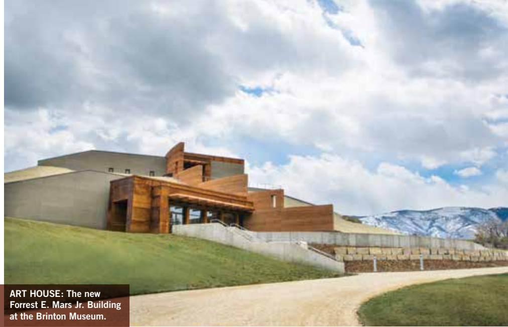
ART HOUSE: The new Forrest E. Mars Jr. Building at the Brinton Museum.