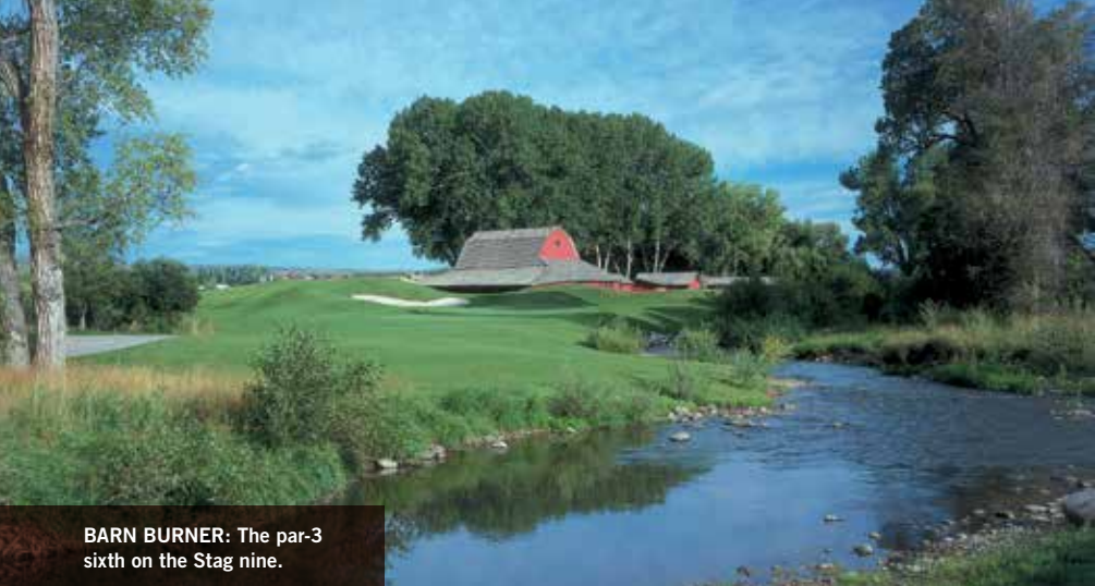
BARN BURNER: The par-3 sixth on the Stag nine.

raising glasses on a golf course—hangs with the inscription: “A toast to the Old West Tradition and the Auld Scottish Game.”