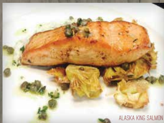
ALASKA KING SALMON