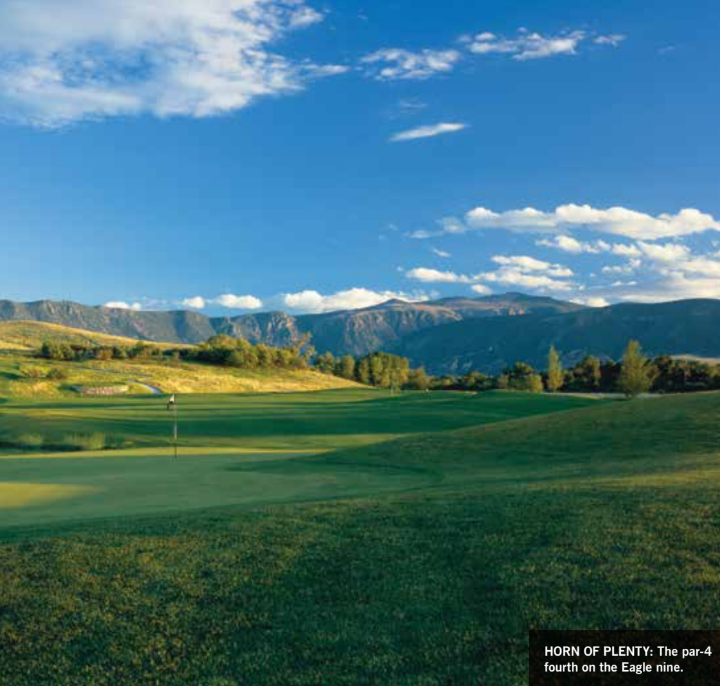
HORN OF PLENTY: The par-4 fourth on the Eagle nine.