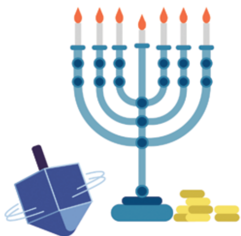
Hanukkah craft table