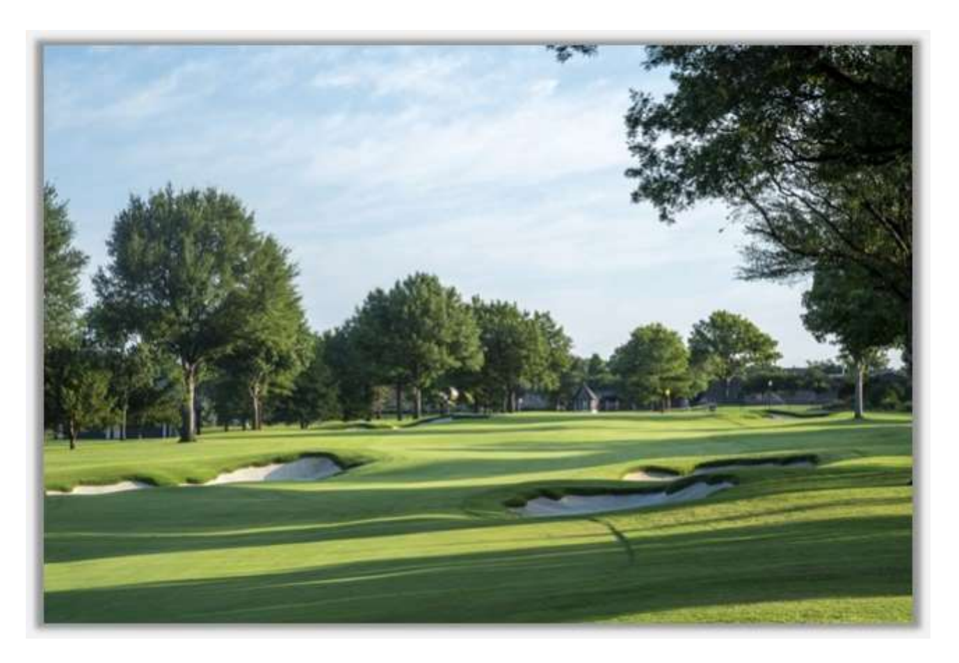
Oklahoma City Golf & Country Club's 18th Hole

Oklahoma City Golf & Country Club, Nichols Hills, Oklahoma, course opened for full play in 2020 following our extensive renovation and restoration of the Perry Maxwell and Alister MacKenzie designed course that originally opened in 1929. We rebuilt pretty much everything on the golf course. We restored old angles with wider fairways and the intent style of the bunkers. We preserved and returned the unique bumps and rolls in fairways and in the approach to greens to make the ground game more integral to play. We also reestablished the character of the greens.