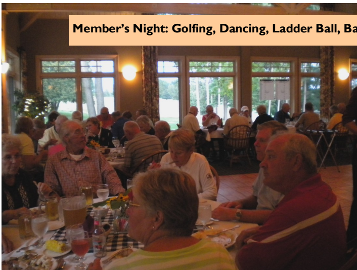
Member's Night: Golfing, Dancing, Ladder Ball, Ball Toss and the Best Pig Roast Ever!