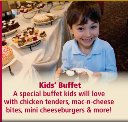
Kids' Buffet A special buffet kids will love with chicken tenders, mac-n-cheese bites, mini cheeseburgers & more!