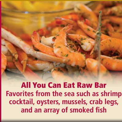
All You Can Eat Raw Bar Favorites from the sea such as shrimp cocktail, oysters, mussels, crab legs, and an array of smoked fish