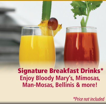
Signature Breakfast Drinks* Enjoy Bloody Mary's, Mimosas, Man-Mosas, Bellinis & more!

...featuring over 111 feet of "brunchy goodness!"