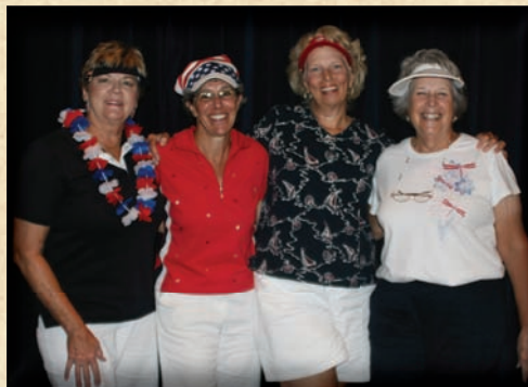
RWB 2 nd Place Team