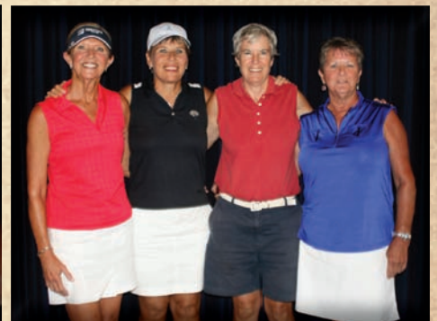
RWB 3 rd Place Team