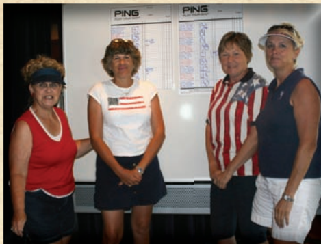
RWB 1 st Place Team