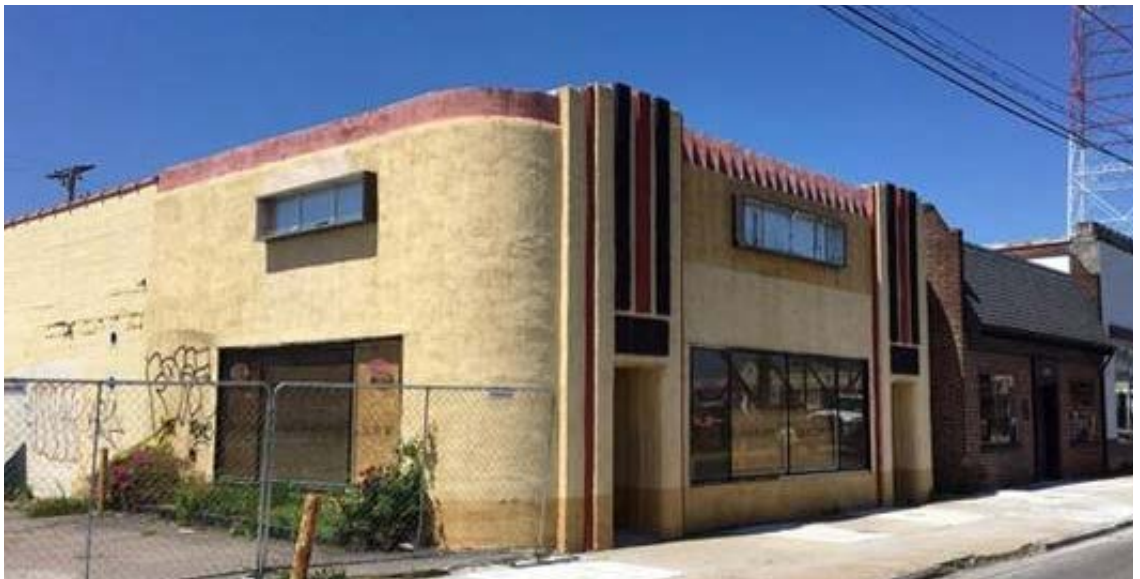
Edge Golf Academy would open in part of a vacant No. 1 Bus Tour property