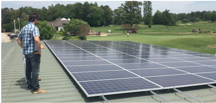
Kiskiack Golf Club installed 88 solar panels to help provide electricity to the golf course with the help of the Hampton Roads Solar Co-op.

Eighteen holes of golf. And now, 88 solar panels.