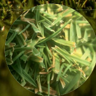
Heritage® Action™ 0.4 oz / 1,000 ft²