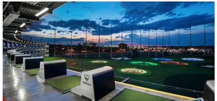
An example of a Topgolf tee line and outfield

The update on a construction timeline is the first public sign of movement on the project since February, when the county board of