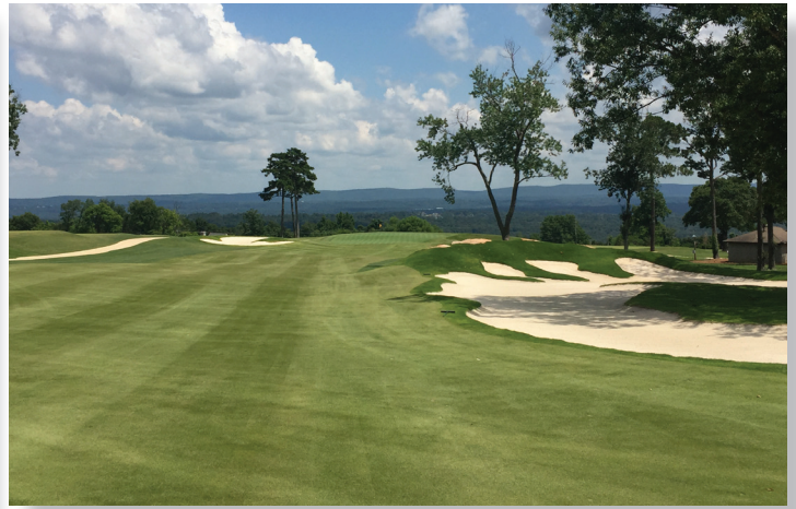
No. 16, the finished product.

beyond comprehension, with, for example, the new 10th hole moving in the opposite direction over a lot of what was the 18th hole.