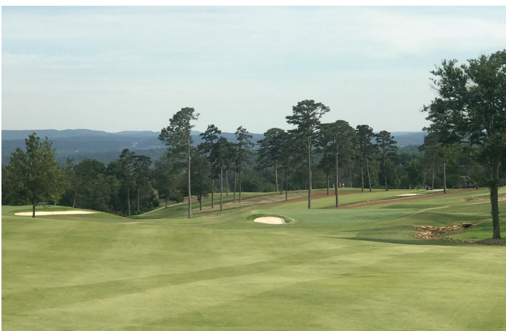
Looking down the new 12th.

There isn't a single hole that didn't receive sizable attention and changes, with all but holes 1 and 9 on the front nine significantly different and not a single hole on the back nine remotely the same. Indeed, the back nine routing is changed