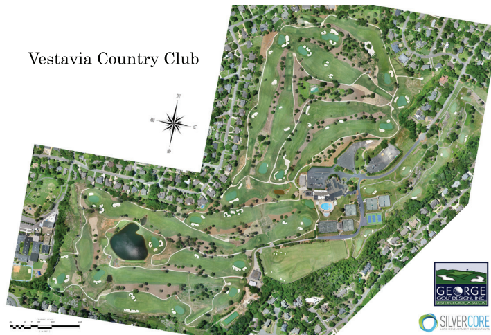
A schematic of the new layout.

George has incorporated a number of specific and classic design features including the "Principal's Nose" bunker in the 11th fairway; "Punchbowl"