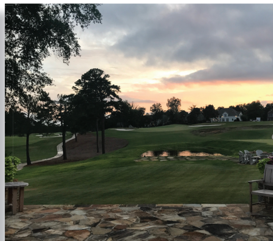
A spectacular view of the new golf patio.

I’ve been following the complete overhaul and redesign of Vestavia Country Club’s course with keen interest and it was my joy to play it a couple of weeks ago.