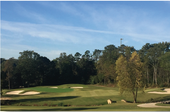
The new third hole.