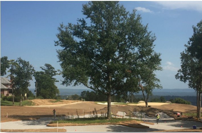
No. 16 under construction.