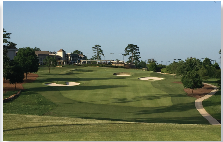
No. 9 features a cavernous bunker in front of the green on this short par 4.