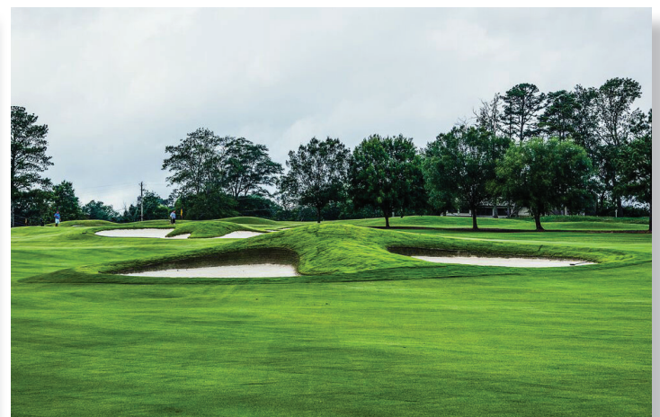
The "Principal's Nose" bunker dominates the 11th fairway.

In recognition of the milestone of reaching my 250th issue, I'm pleased to offer a special "Lifetime" subscription offer of $100 for 10 years of issues! That's right, this special offer is available now and will mean you won't have to pay $30 annually, but rather a one-time payment of $100 for up to 10 years of issues. This option is available when you click the Subscribe Now! button.