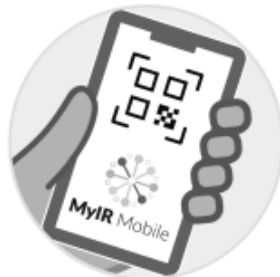
Record from MyIRMobile.com or other app