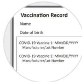
Printed record from vaccine provider or MyIRmobile.com