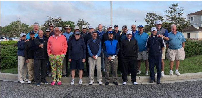
The Rough Riders

On April 4, the teams played a front nine four ball tournament (2-man match play) and a back nine scramble. The points earned from this day placed "The Rough Riders" ahead in the competition by 1-point points. On April 11, an 18-hole individual match play was conducted, and this put "The Rough Riders" out in front with a score of 52.5 to "The Dewsweepers" 46.5. The entire event was exhilarating two weeks of competition but more importantly, camaraderie and fellowship throughout.