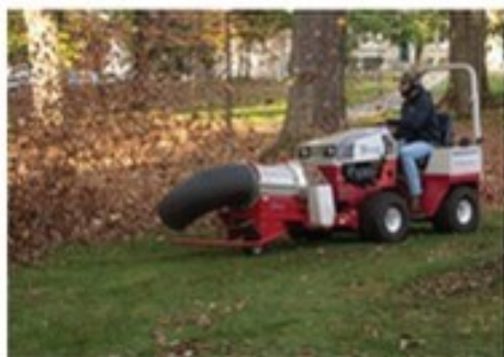
Leaf Clean Up