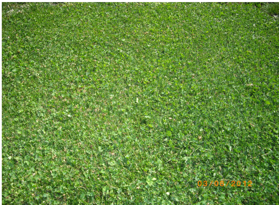
Clover in Poa Annual

Prior to many of our births it was very common to mix Dutch white clover with grasses so that there was a level of nitrogen fertility being provided. This practice was eliminated with the use of “cheap” inorganic sources of fertilizer. Well, they are not “cheap” anymore.