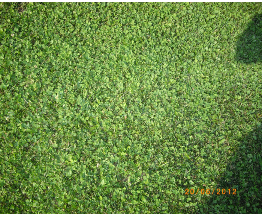
Clover in Kentucky Blue Grass

Yet the public/bosses have come accustom and are still demanding a nice dark green turf.