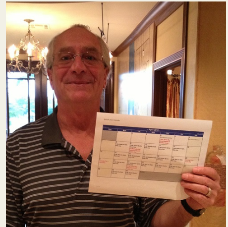
A resident of Treviso Bay Comes and picks up his monthly calendar!