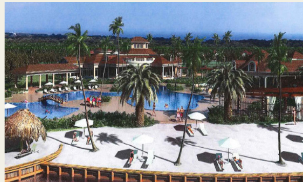
The newest rendition of our Champions Clubhouse!