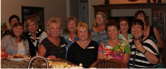
Some of our homeowners decided to throw a little get together!