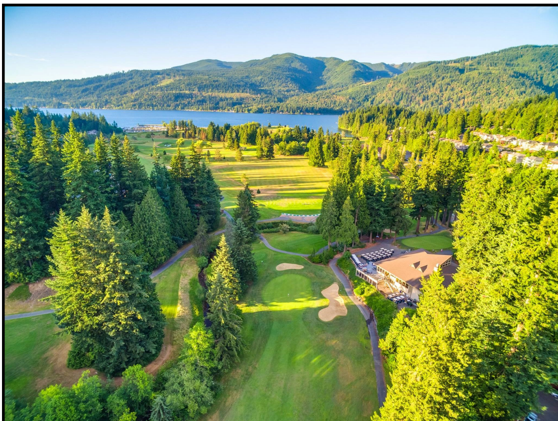
Aerial View Overlooking No. 18 Green

https://www.usga.org/content/usga/home-page/rules-hub/2023-rules-of-golf/2023-rules-resources.html