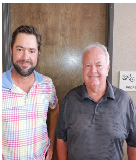
Westin and Thane PDP Instructors