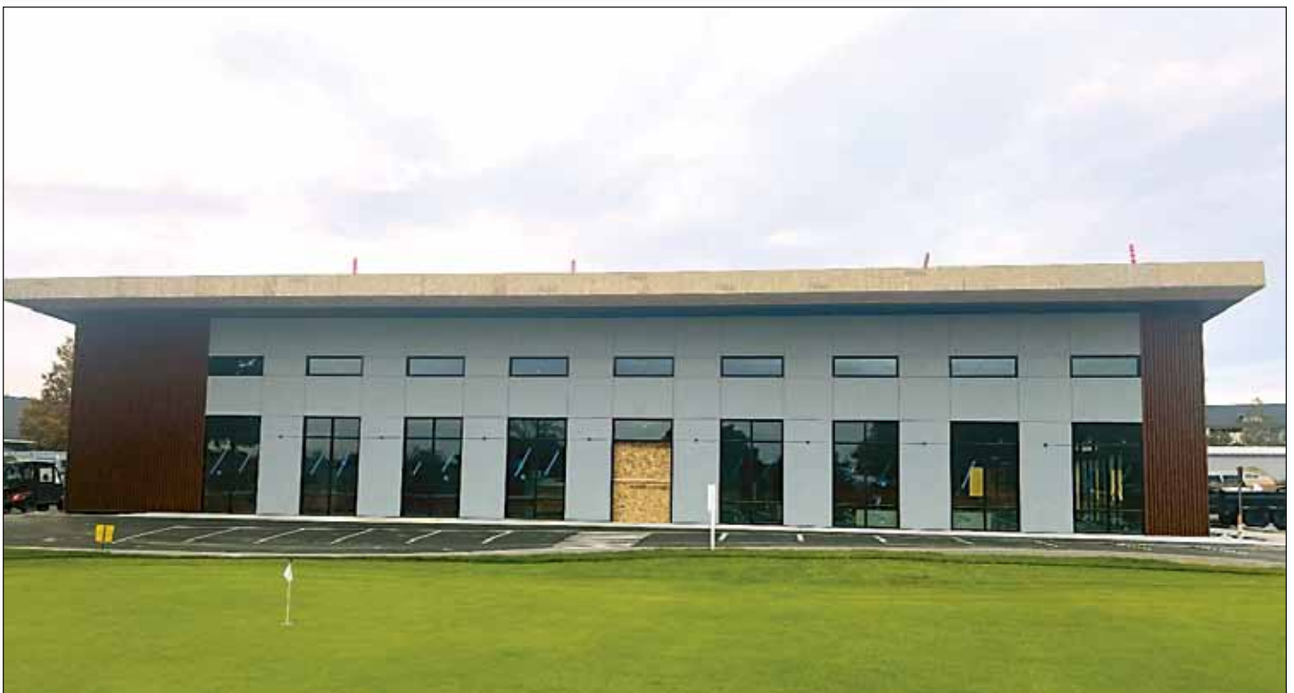
A view of the front of the new Golf Universe Store.