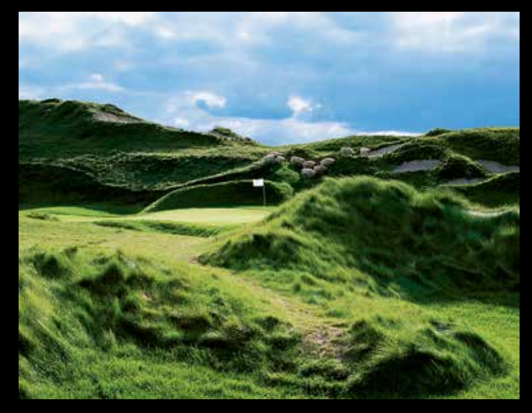
THE IRISH AT WHISTLING STRAITS