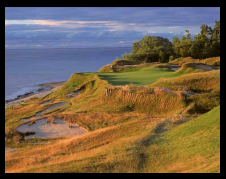
THE STRAITS AT WHISTLING STRAITS®