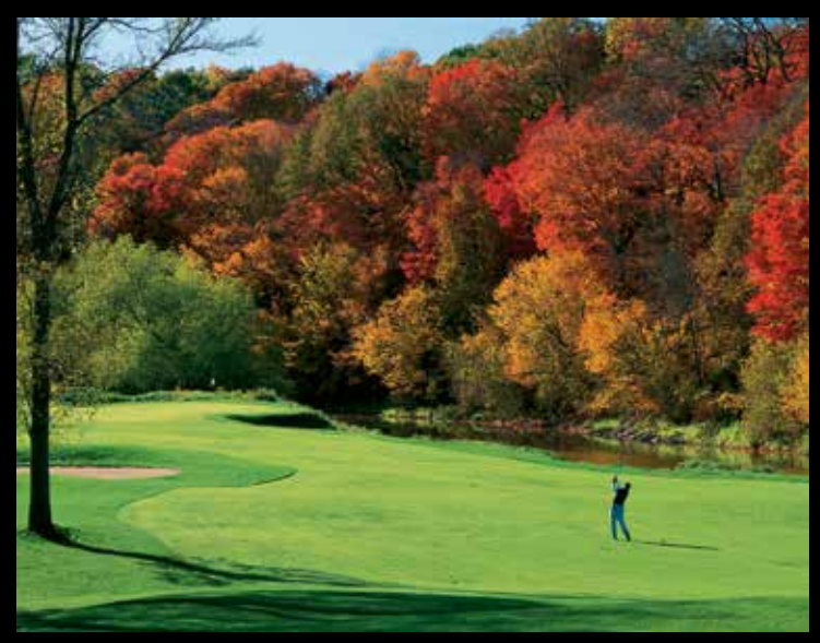
THE RIVER AT BLACKWOLF RUN®