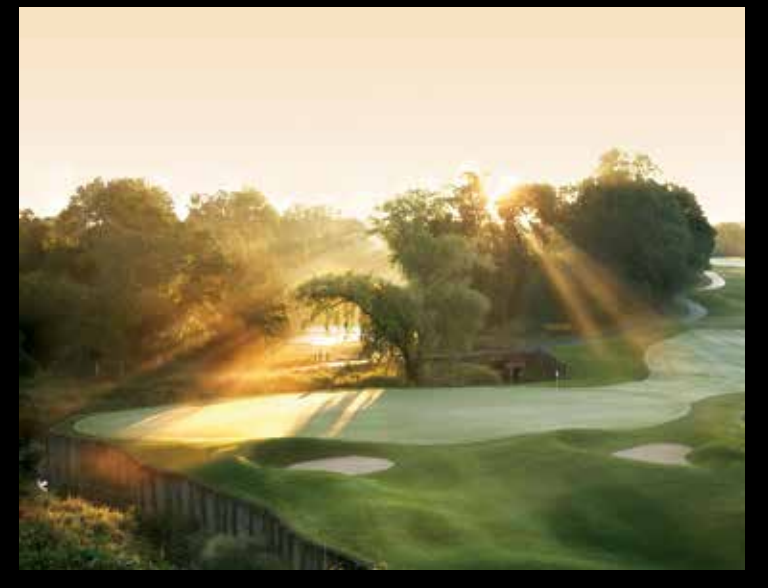
THE MEADOW VALLEYS AT BLACKWOLF RUN