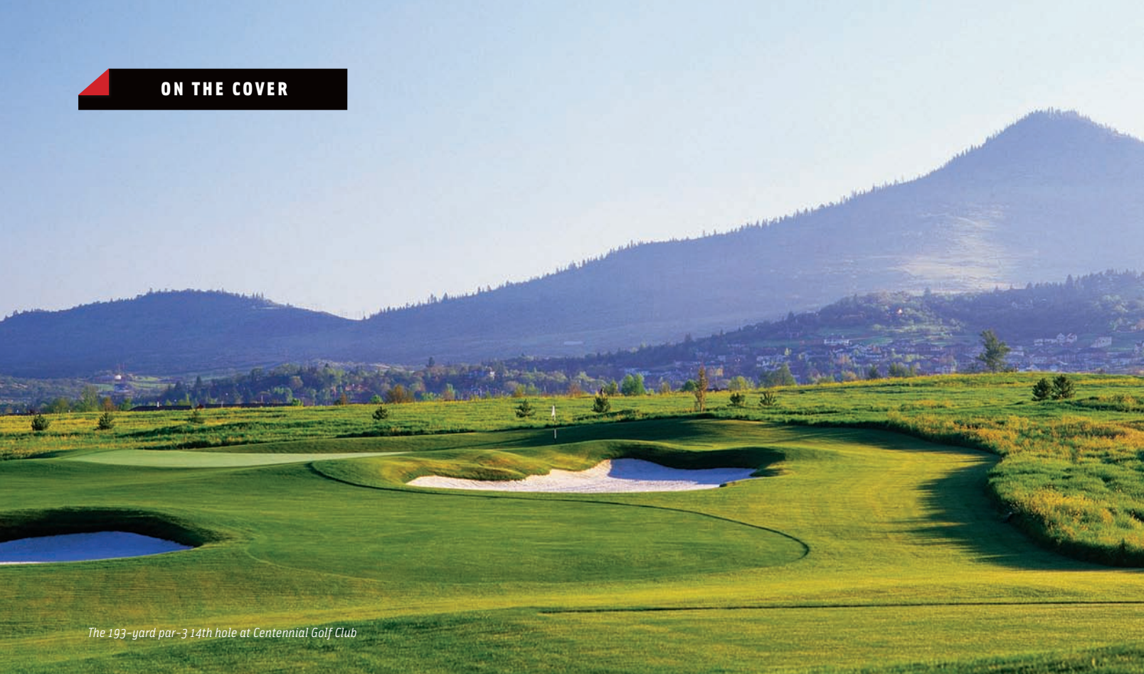
Southern Oregon Sensation

Centennial Golf Club shakes up the golfscape in Southern Oregon