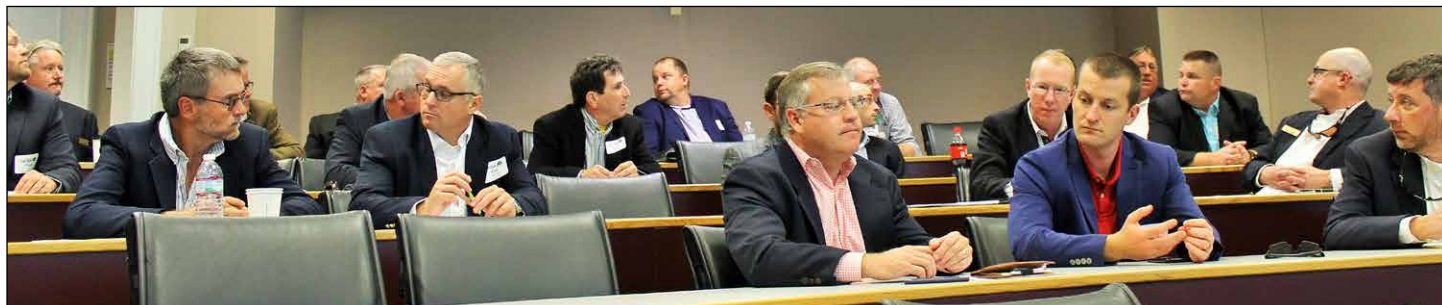
The Darden Conference Center showcased great facilities for over 100 conference attendees.