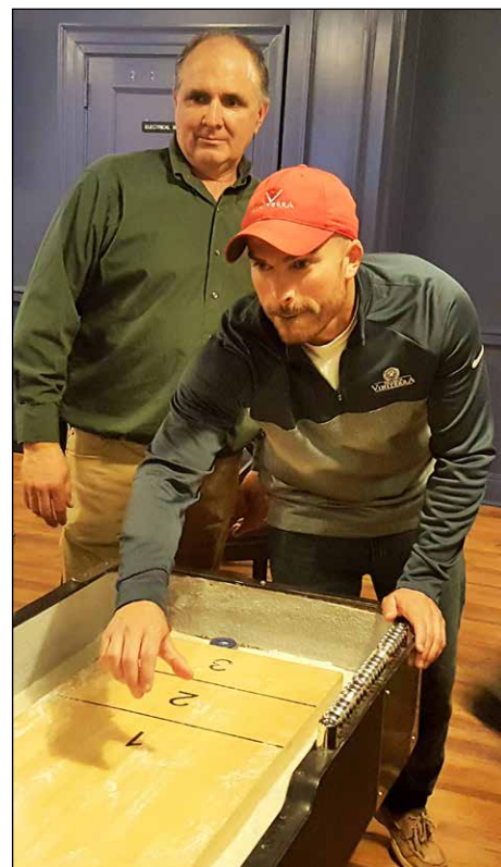
A little shuffleboard match during the Monday Night Football Party.