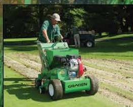
Graden with Sand Injection