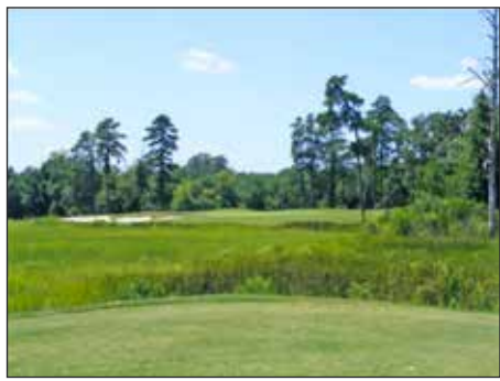
The scenic par-3 16th hole plays over the marsh.