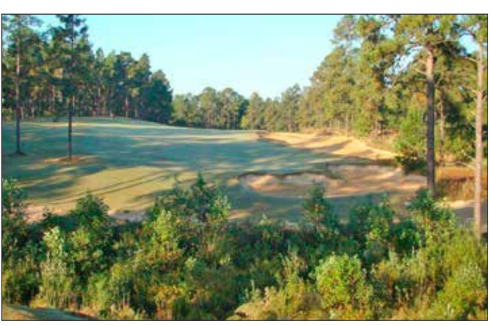
Forest Creek Golf Club in Pinehurst