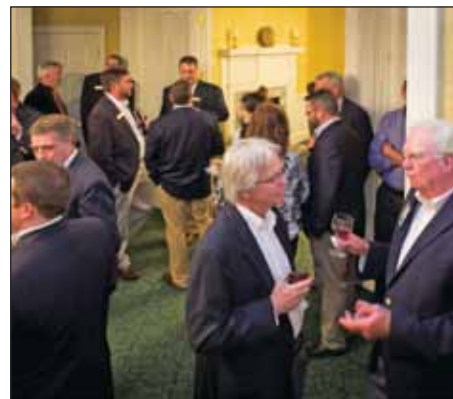
Annual Meeting participants enjoy the opening reception.