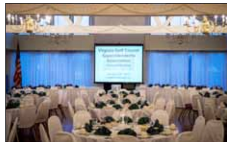
Fredericksburg Country Club hosted the 2013 Annual Meeting

Landscape Supply was the Presenting Sponsor and Syngenta was the Reception Sponsor. The trolley transportation was co-sponsored by Agrium and Trinity Turf . Other sponsors included WinField and Precision Labs .