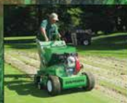
Graden with Sand Injection