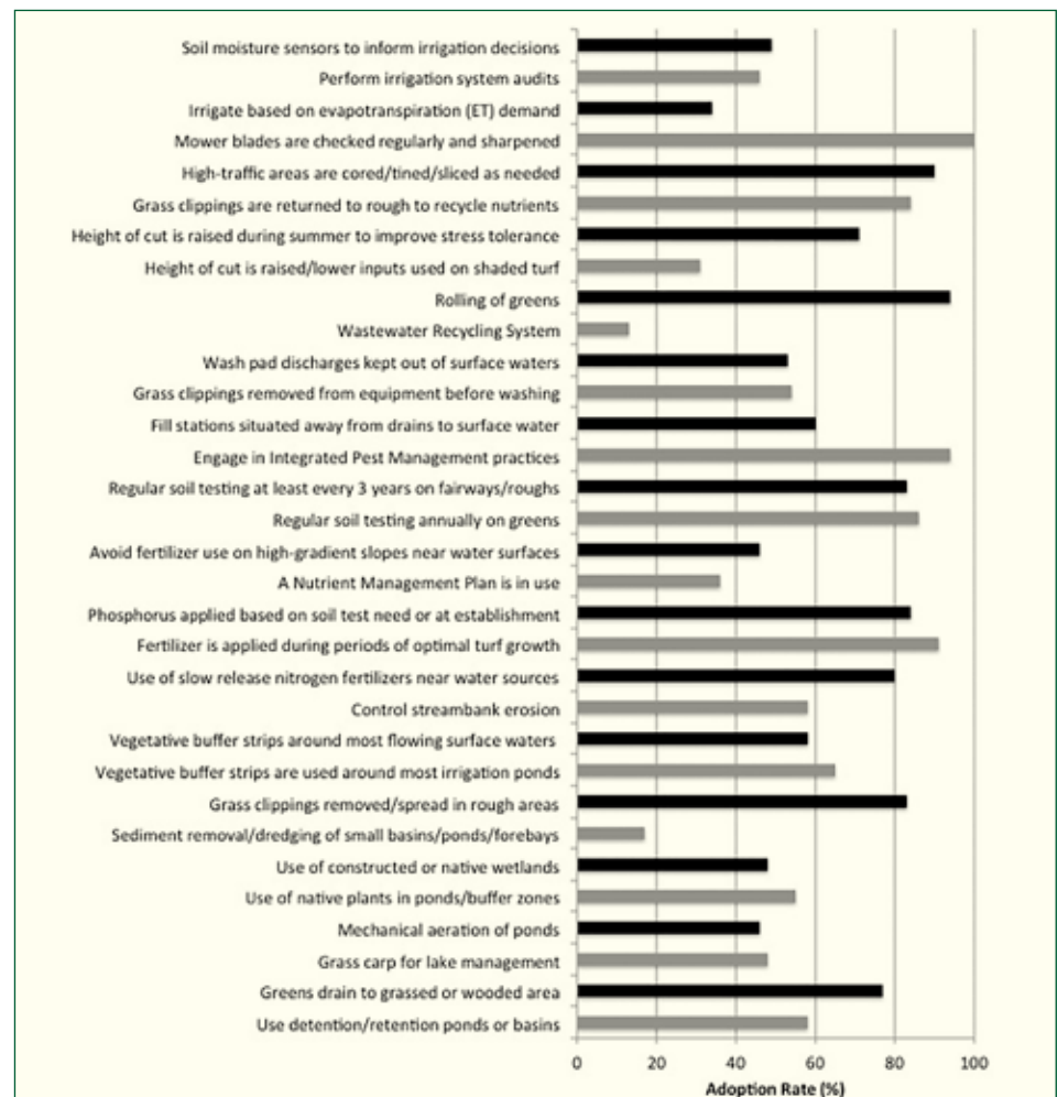
Figure 1. Adoption rate of selected golf course Best Management Practices for optimal turfgrass growth, nutrient management, and water quality protection.

Overall, the management of golf courses in Virginia appears to be environmentally focused and many BMPs are being used to grow high quality turfgrass while protecting natural resources. Furthermore, 30% of golf courses surveyed are currently members of the Audubon Cooperative Sanctuary Program for Golf, and 58% of courses either plan to obtain certification, or are considering doing so. As the deadline for the mandated NMPs near, we expect the adoption rate of BMPs to increase. Nutrient Management Plans will highlight the risk areas that are specific to individual golf courses, and will allow superintendents to make more targeted, effective BMP implementation when needed.