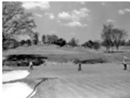
“Old” Hermitage CC Hole #1 – looking back from the green

It was 2005 when Tropical Storm Gaston hit, and the first green flooded, along with the adjacent trailer park. Afterwards Flannagan found a heating oil tank sitting in the middle of #1 green. The green on #2 was completely washed away. The storm convinced the county that it was prudent to move the green to the other side of the creek, turning one of the hardest starting holes in Virginia into a rather simple one, quite short. In the years since, Flannagan reports that his work became routine, with