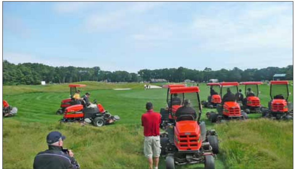
The crew readies nine mowers in preparation of mowing the fairway in one direction.