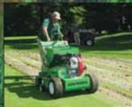
Graden with Sand Injection

Call us at: 1-800-888-2493 or email: harmonturf@comcast.net