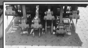
Soil Reliever Deep Tine Aeration