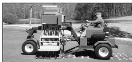
Drill / Backfill Aeration Bit Sizes: ¾" x 12" or 1" x 8" Straight Drill Aeration Available