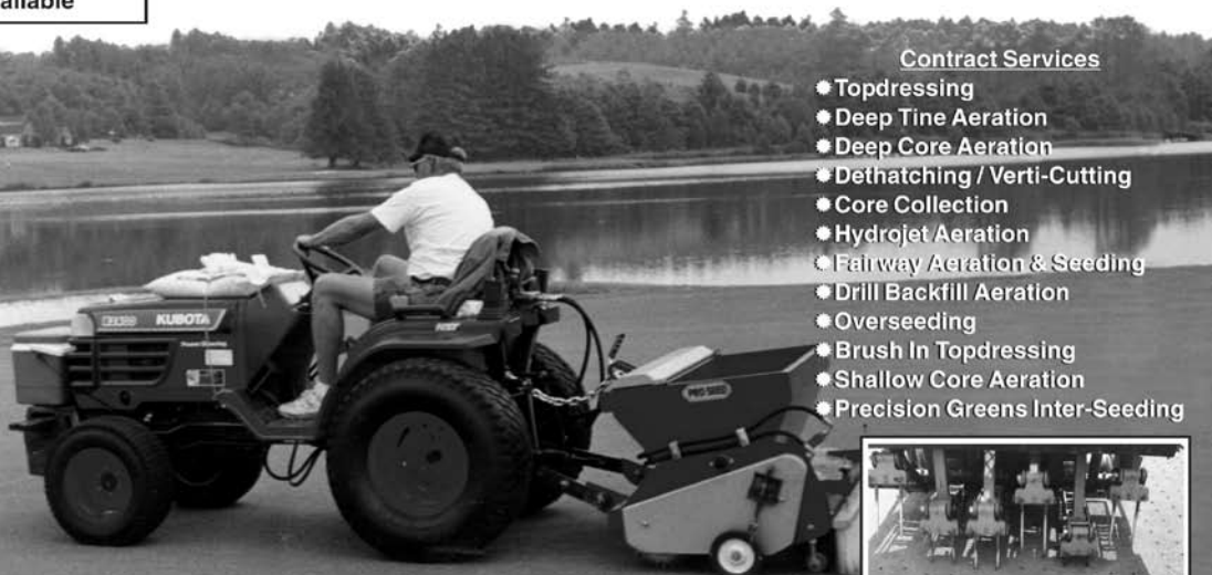
Pro Seed Greens Inter-Seeding