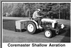
Coremaster Shallow Aeration