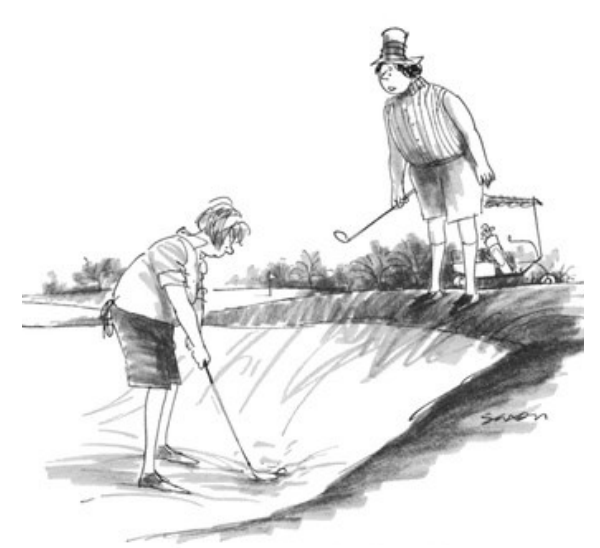
"Think beautiful thoughts...."

As I sign off, I wish all Men's Club members Happy Holidays and I look forward to playing golf with many of you next year.