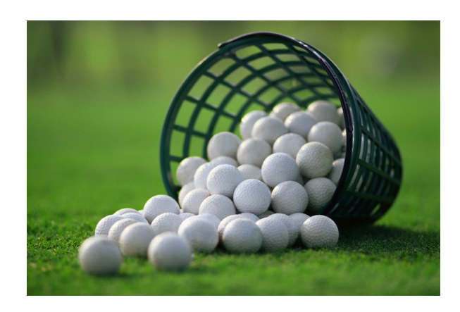
The Driving Range Is Closed Until Spring 2022

There are many great private clubs out there, so take advantage of the benefits of being a member at Sequoia Woods.