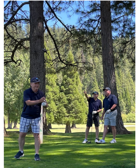
A shady part of the course