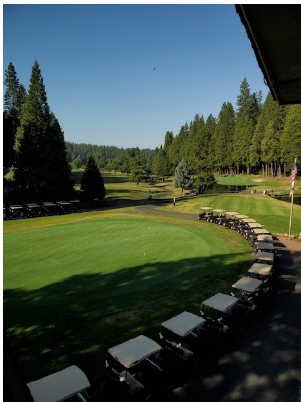
Early morning shadows on the golf cars, all lined-up and ready for the first players of the day...

We'll keep everyone updated if conditions change. Thank you for your support of the club, and enjoy the beautiful course!