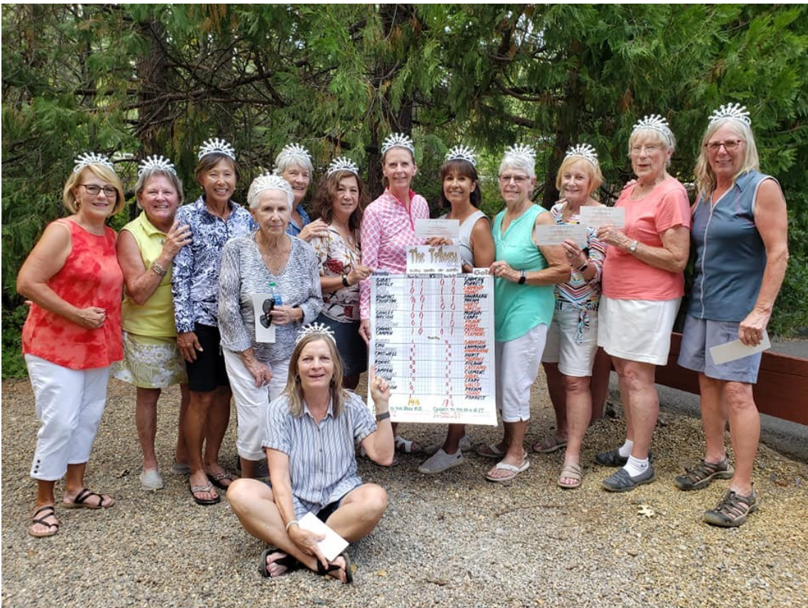
Women's 18-H Trilogy Winners 2021!