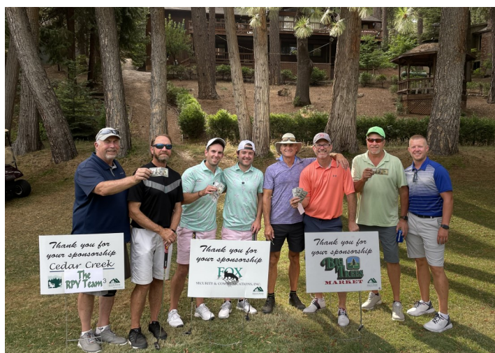
Horse Race Winners 2021!