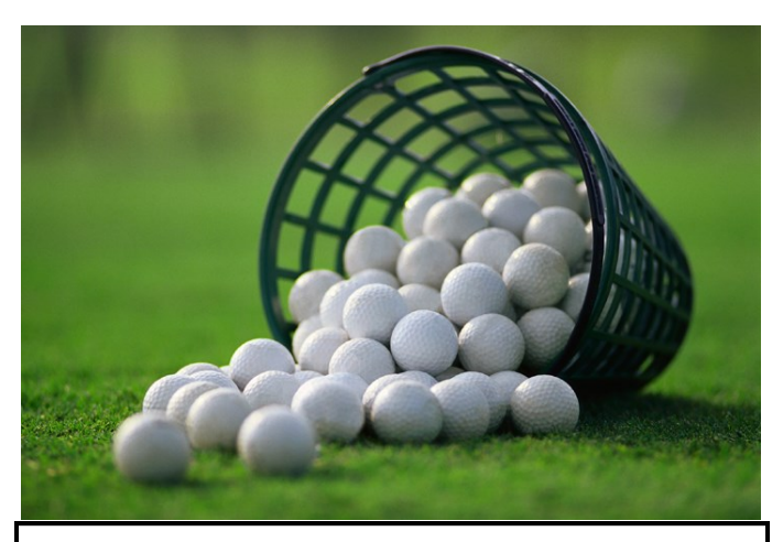
The Driving Range, is Closed Until Further Notice

Mornings can still be rather cool in June, so play is not permitted before checking in with the golf shop staff. Days are now longer and Twilight is a wonderful time to play. Golf carts are now required to be returned to the club house by 8:00pm.