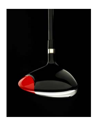
The 'Q' Fairway Wood