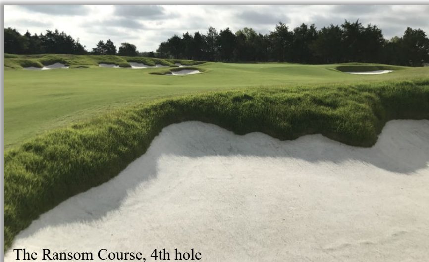
The Ransom Course, 4th hole

The four-hole loop course, part of the golf facility for the University of Oklahoma golf teams, takes practice to another level with holes that can be played as par-three, par-two or par-four holes from a wide variety of distances and angles. Players can practice every shot imaginable from a variety of angles from 100 yards in with fairways and bunkers approaching each of the four greens. Within the framework are two short par-four holes that allow players to practice different tee shots down the hole 'driving lanes,' which are oriented south and north.