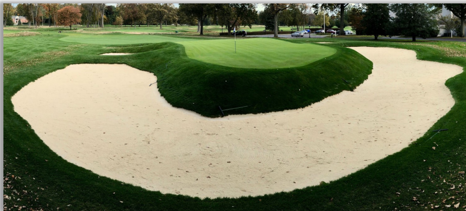
18th hole greenside bunker