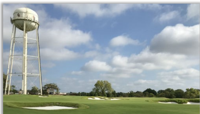
The Ransom Course, 1st hole