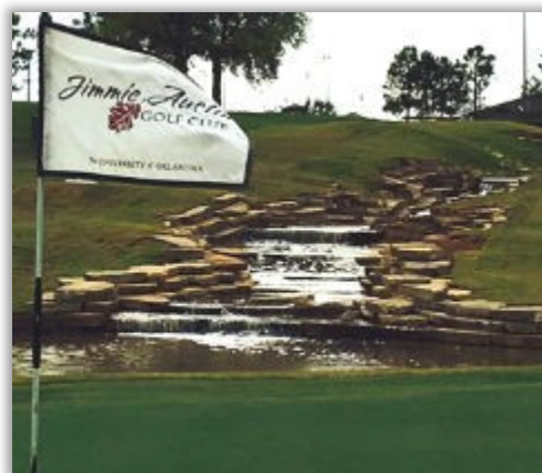
New creek near the 11th green