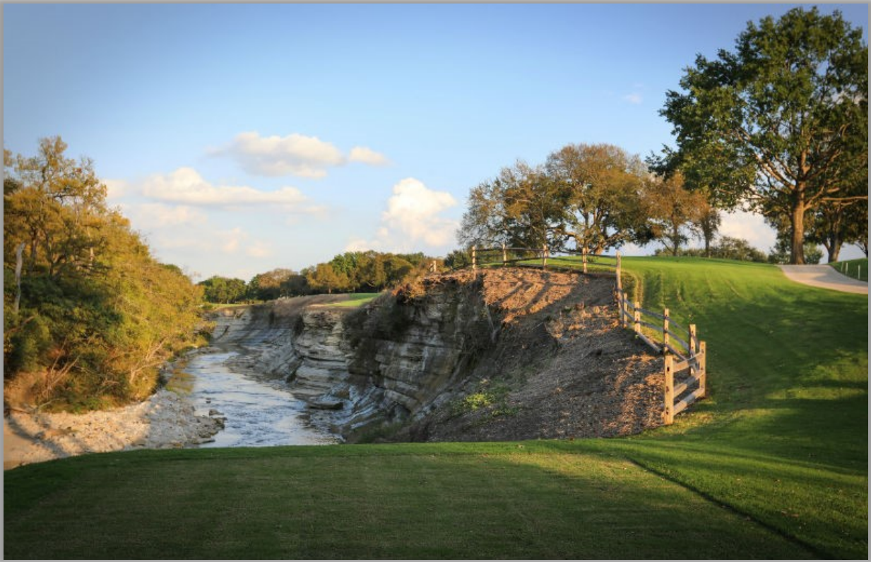
14th Tee: "Some of the best designs are simply found instead of built." — Tripp.

The Northwood Club, host of the 1952 U.S. Open, is undergoing a complete course and driving range renovation. Tripp is influenced stylistically by the original Northwood golf course architect William Diddel, who designed the course in 1947. The project involves rebuilding all greens, tees, bunkers and reshaping most fairways, along with new cart paths, drainage and a new irrigation system. The shaping and drainage are nearing completion with all plantings done. The main course will open Spring 2018.