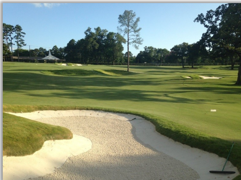
Willow Brook Short Course