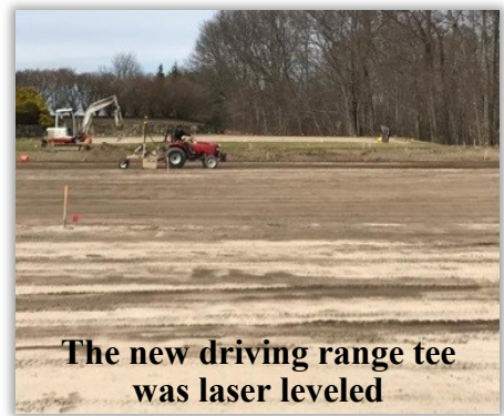
The new driving range tee was laser leveled