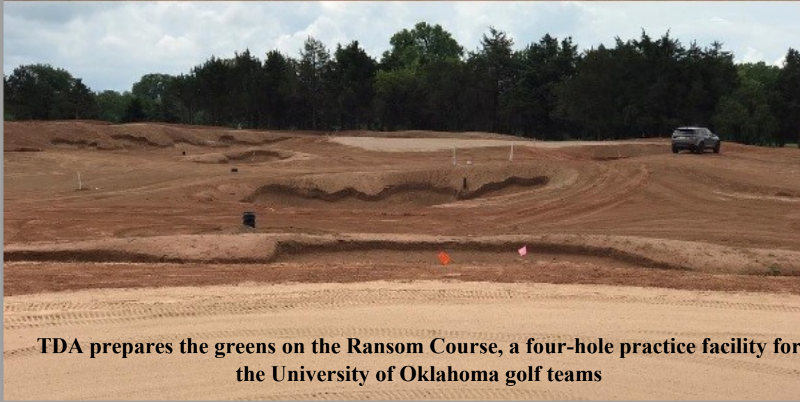
TDA prepares the greens on the Ransom Course, a four-hole practice facility for the University of Oklahoma golf teams

The Ransom Course, a new four-hole practice course for the University of Oklahoma men's and women's golf teams, is under construction and is expected to be completed for an October 2017 opening. Located at the Jimmie Austin Golf Course at the University of Oklahoma in Norman, this practice area will feature multiple bunker styles and different grass types, along with varied design features, allowing for the University's golf teams to prepare for tournaments around the country.