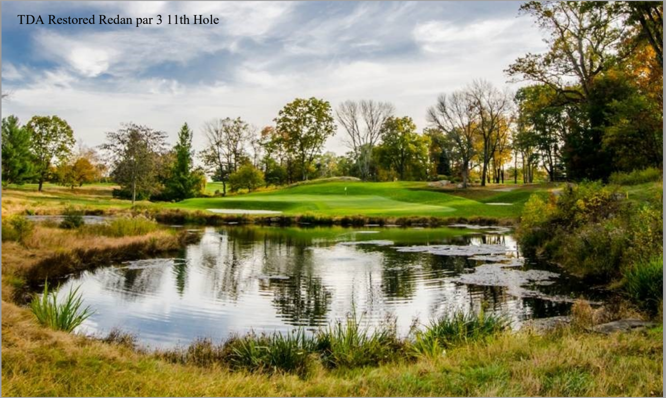
TDA Restored Redan par 3 11th Hole