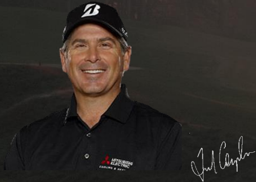
A Fred Couples Signature Course

Our Fred Couples' signature championship golf course is one of the premier courses in the Mid- Atlantic region.