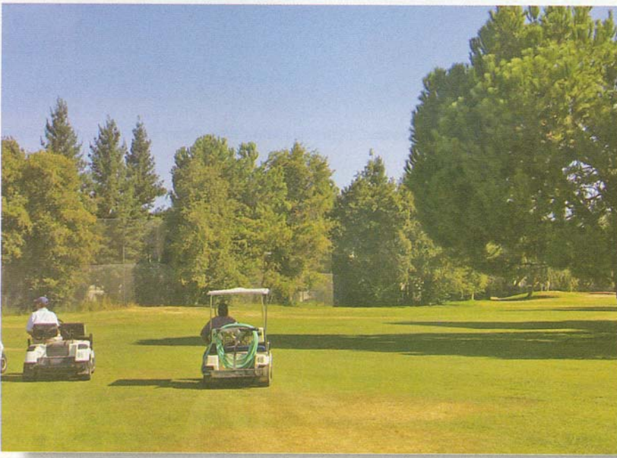
Figure 2. Brown areas on the course are a sign of inadequate spacing or overlapping of irrigation heads, which produce nonuniform turf and also waste water.